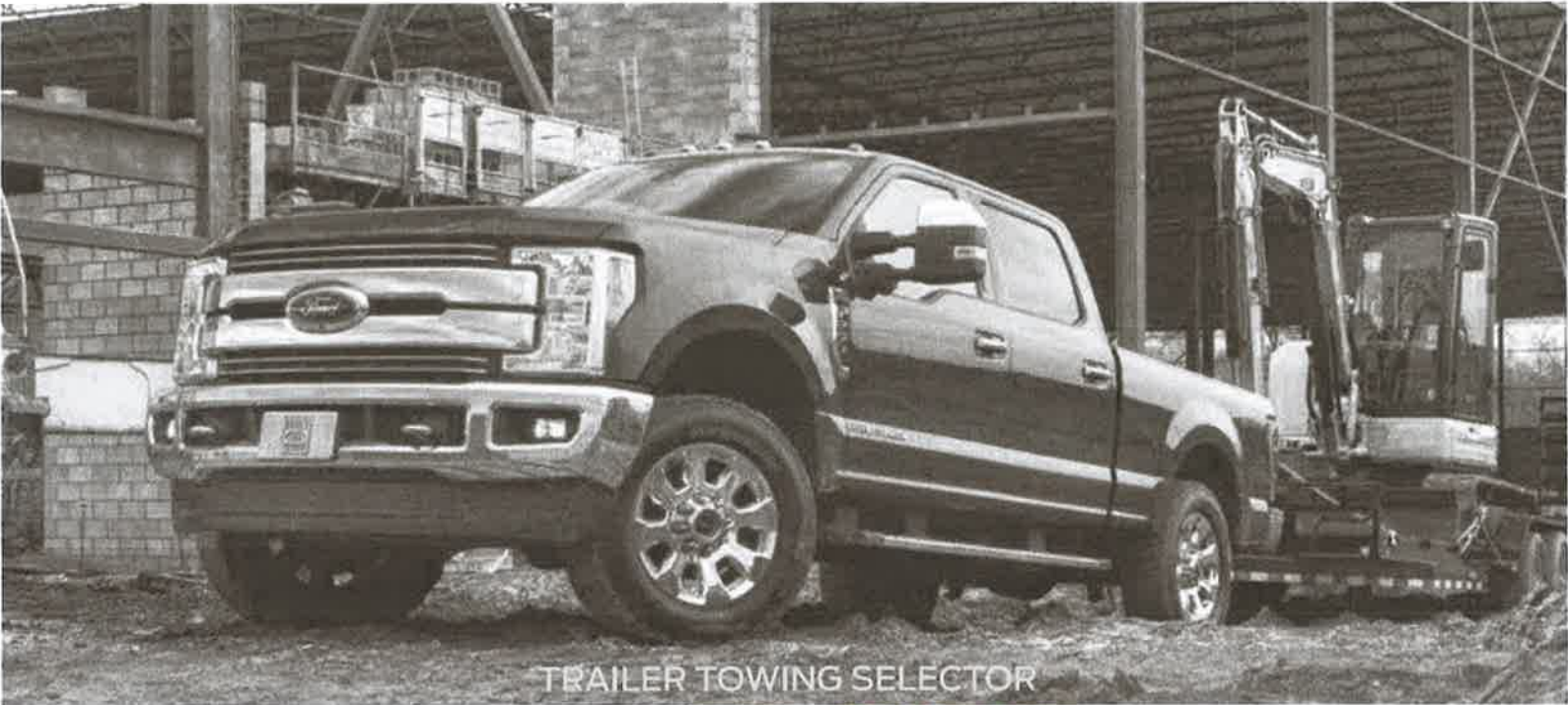
2018 model shown.